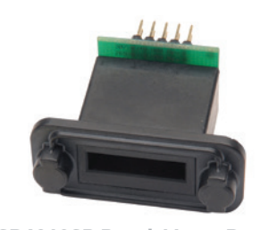
SR4310SP Panel-Mount Receptacle

The Greentronics RiteYield yield monitor system uses internal memory for data logging and uses the RUGGEDrive token to transfer data from the system to a computer for analysis. A DFX PC adapter is used to read the DFX memory tokens on the computer. When the memory token/adapter pair are plugged into a computer's USB port, the system sees it as a standard removable drive (like a flash drive). Yield data can then be opened on or transferred to the computer.